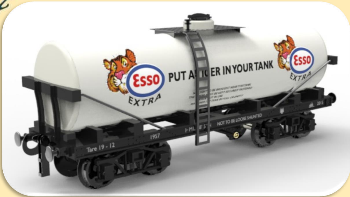
16. Esso - Grey