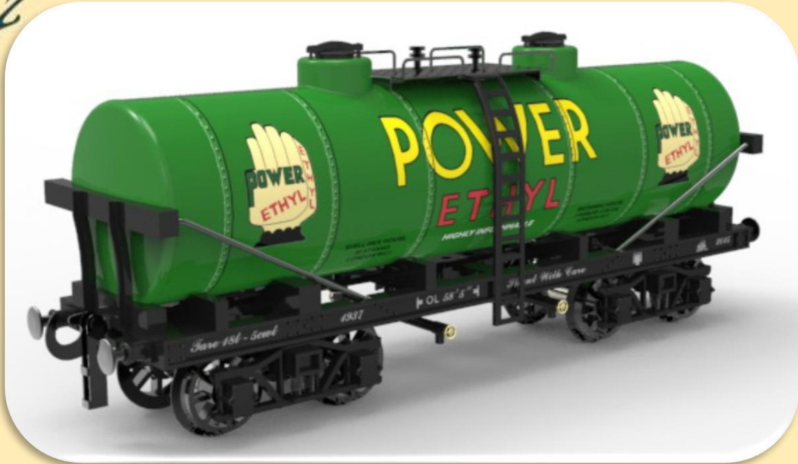
5. Power Ethyl