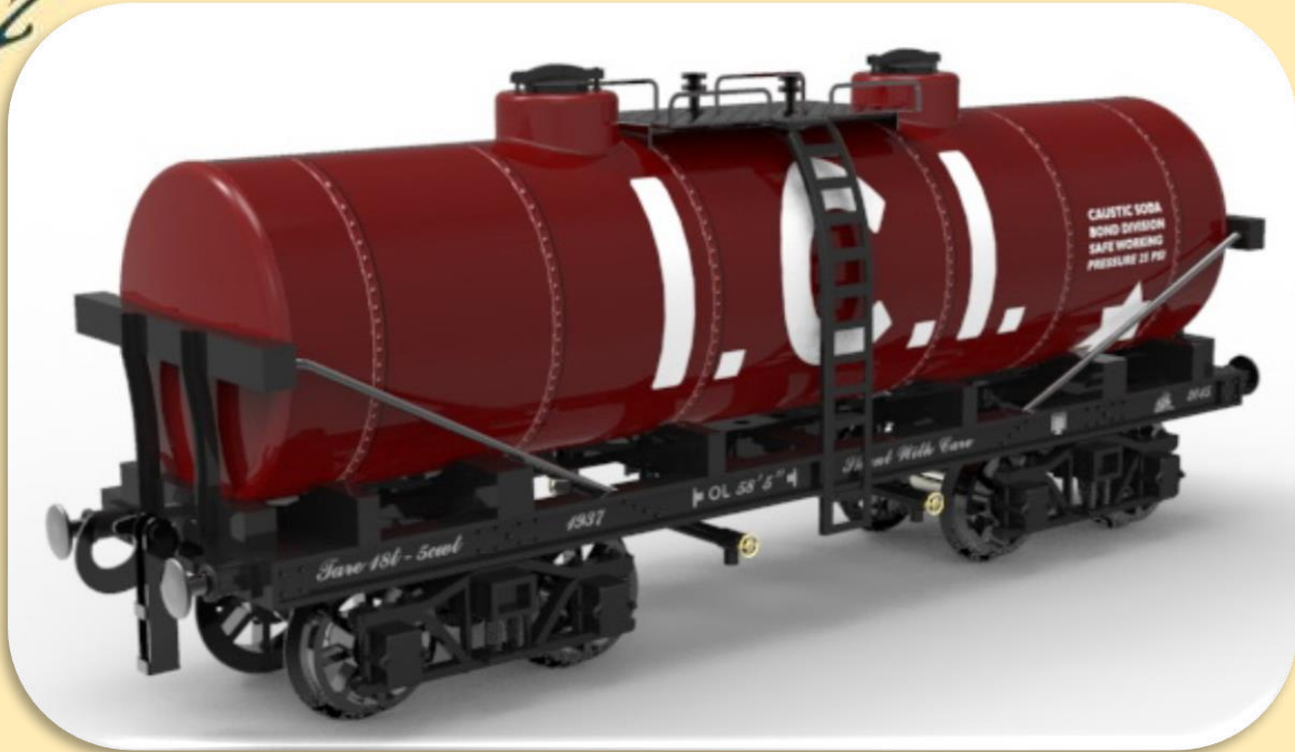
7. ICI - Maroon