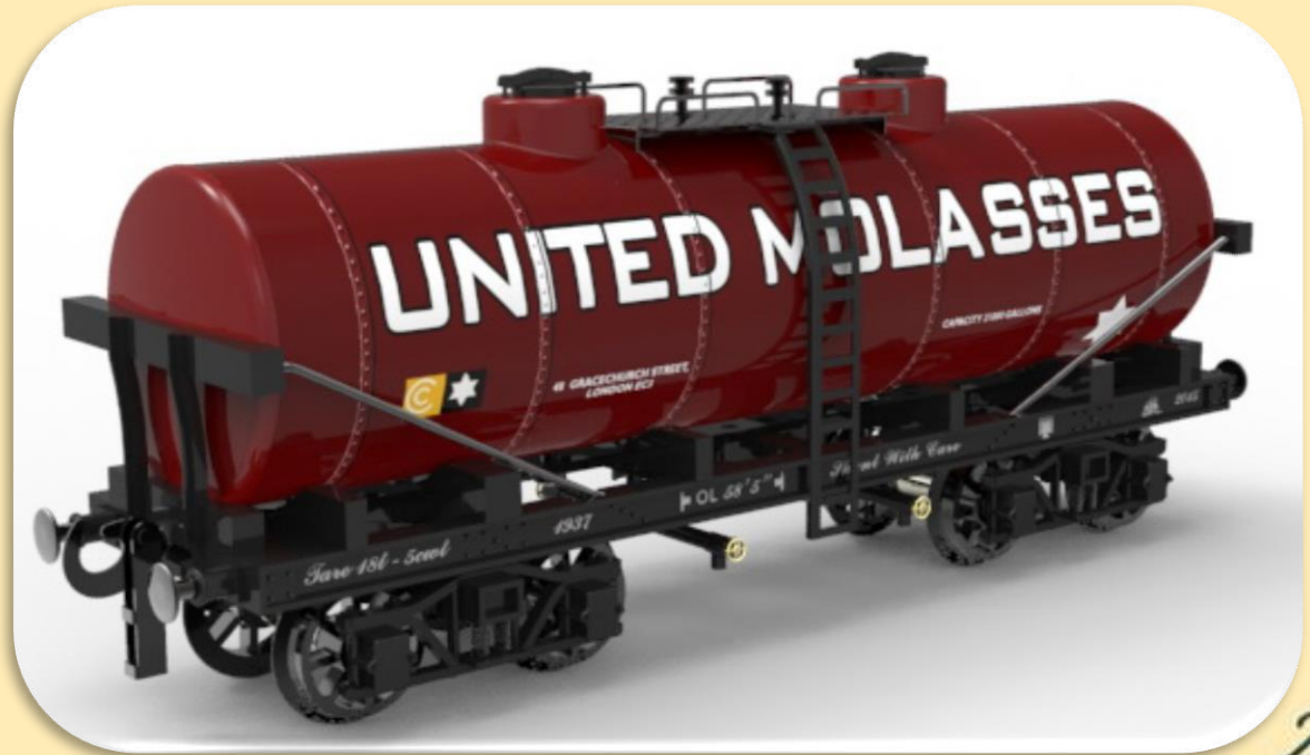
6. United Molasses