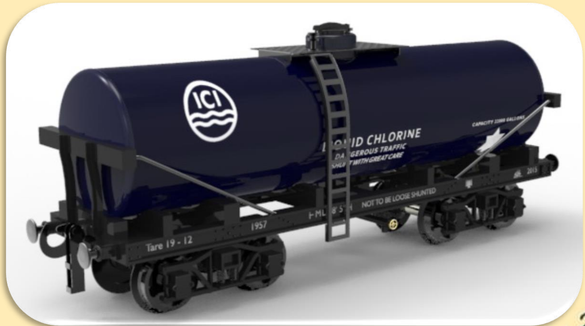
17. ICI - Blue