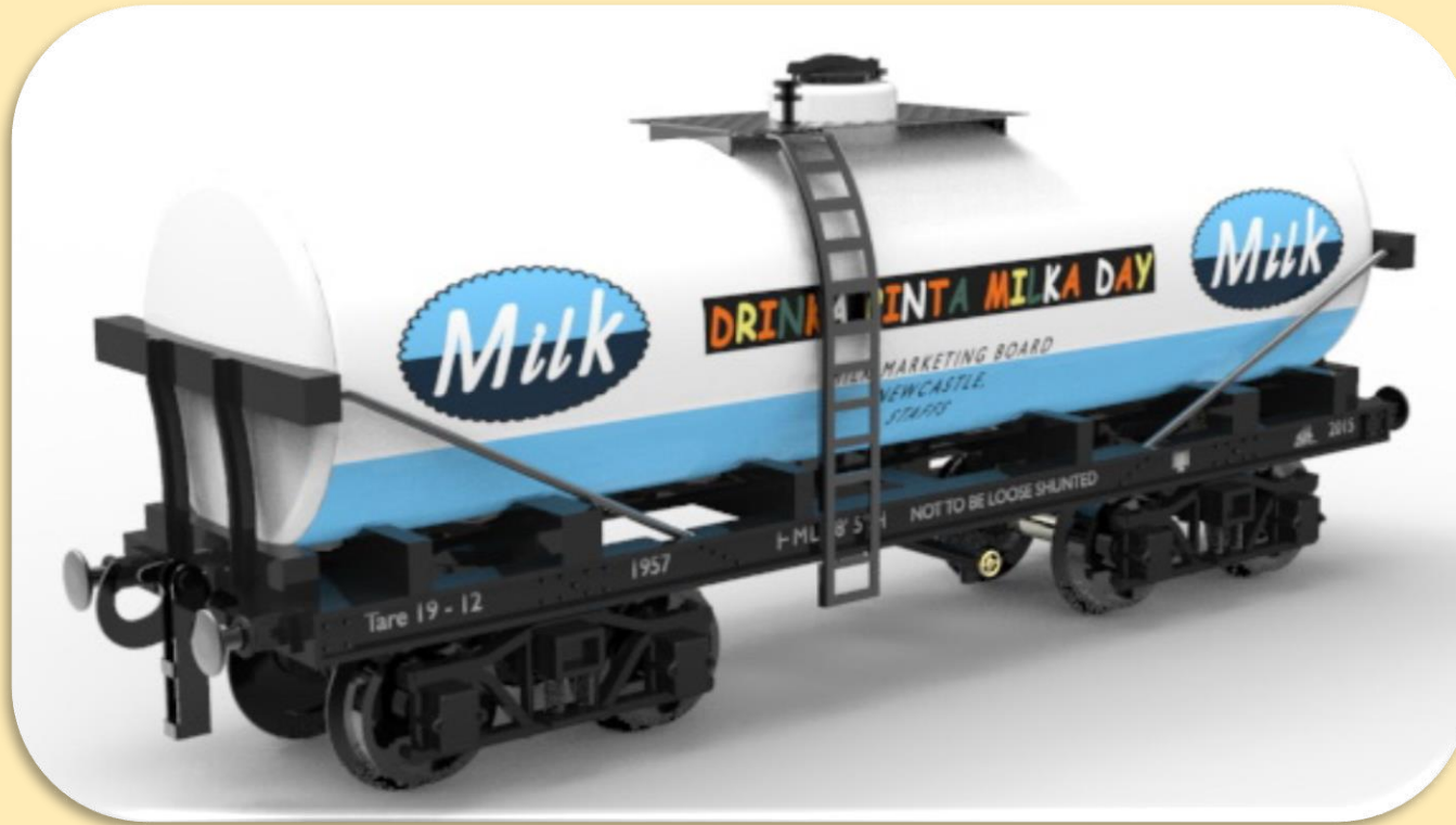
20. Milk Tanker