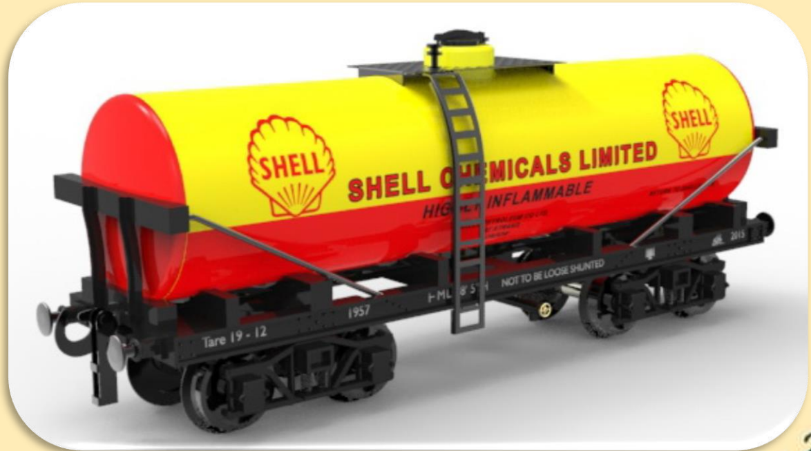
19. Shell Chemicals