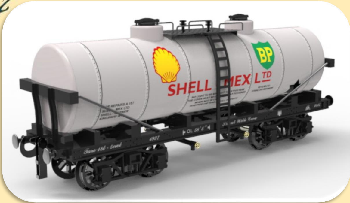
3 .Shell Mex