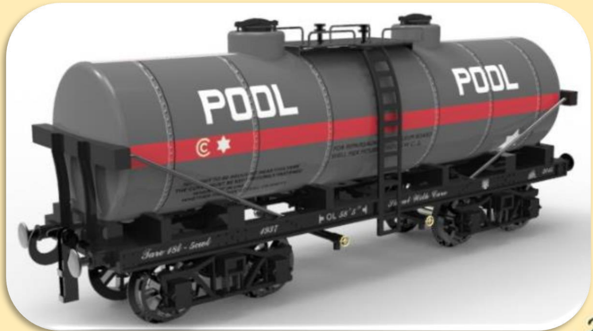
8. Pool - Grey