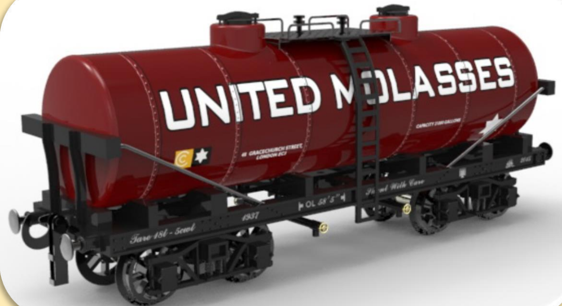
6. United Molasses