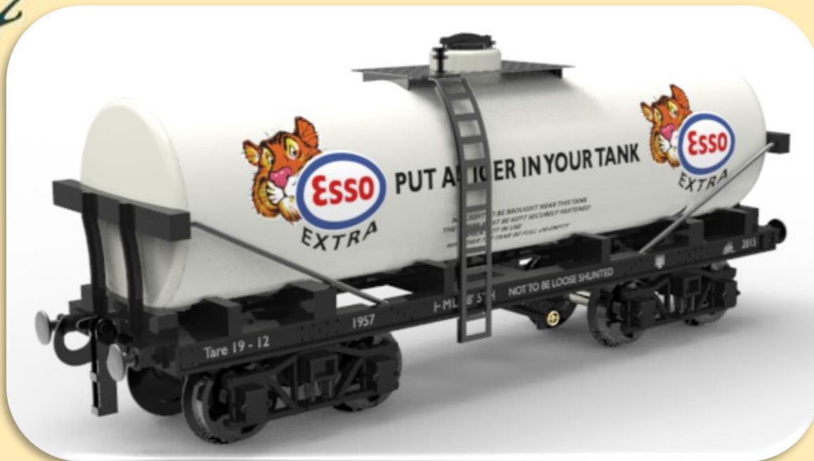
15. Esso - Grey