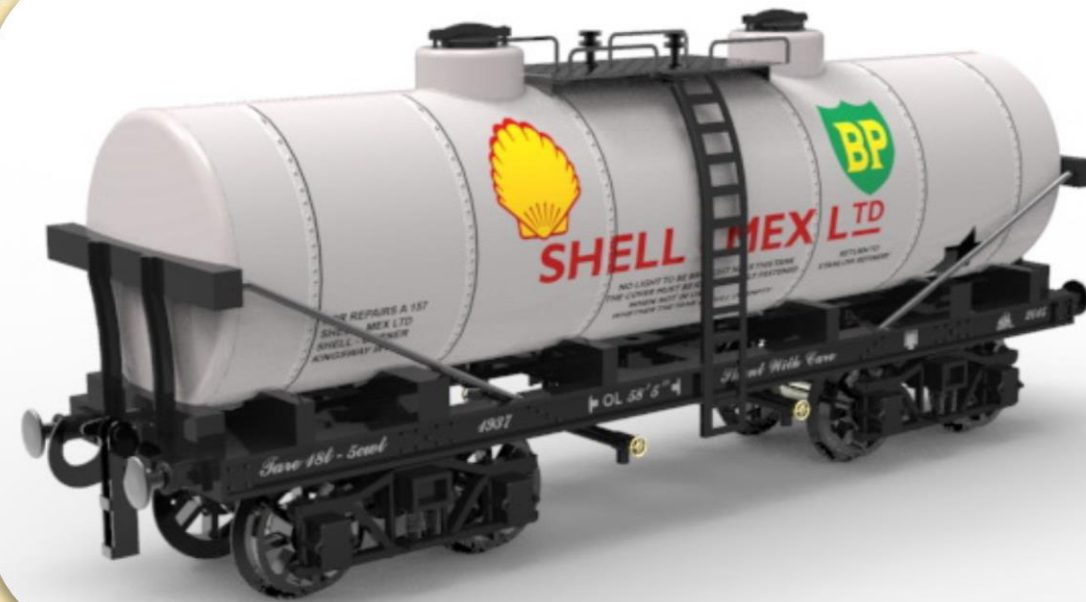
3 .Shell Mex