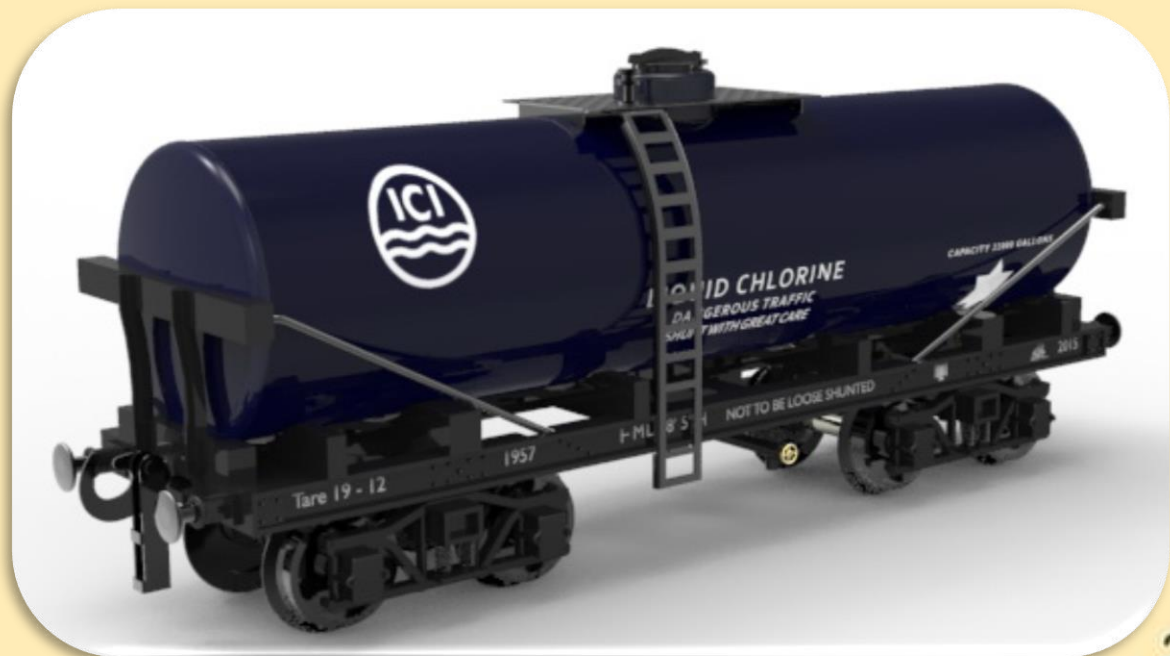
16. ICI - Blue