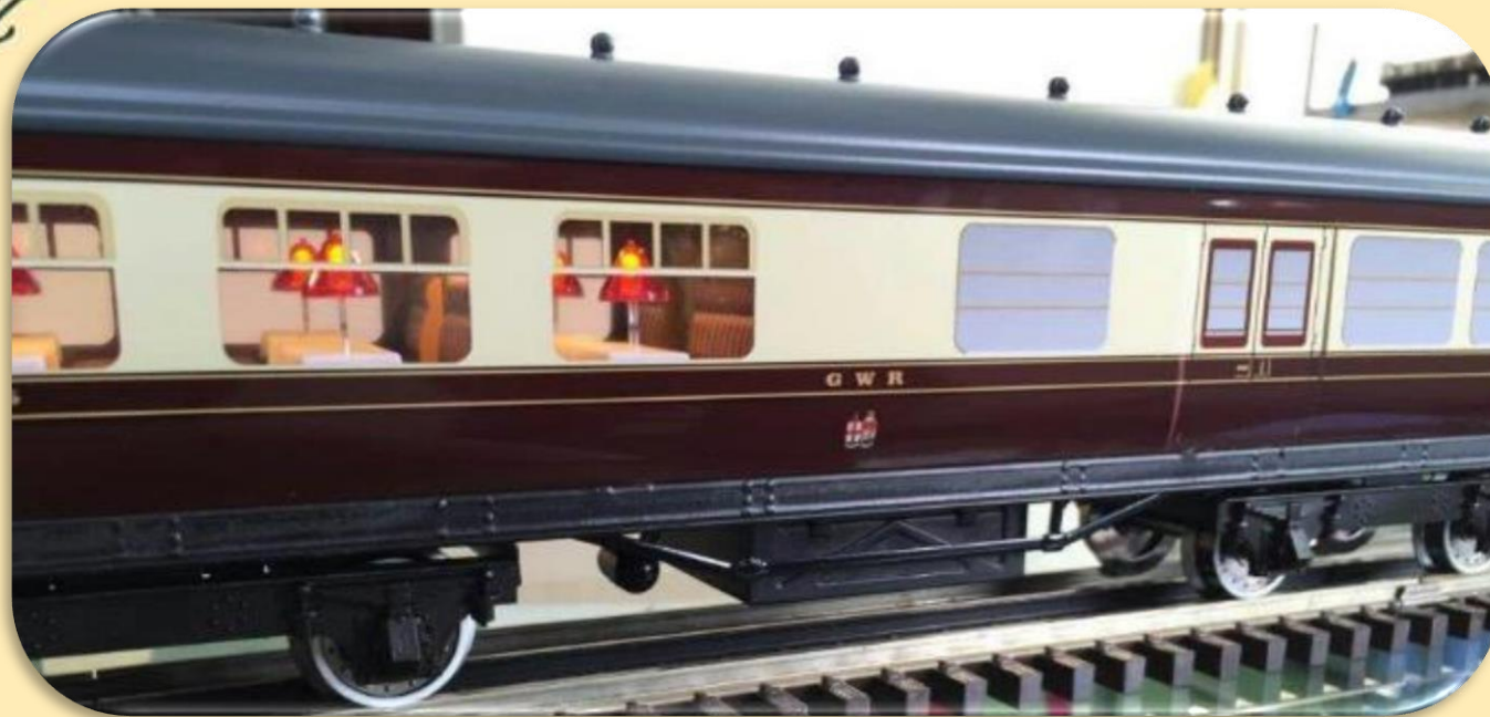
GWR diner with recessed main doors

The Production has been checked and is ready for shipment now