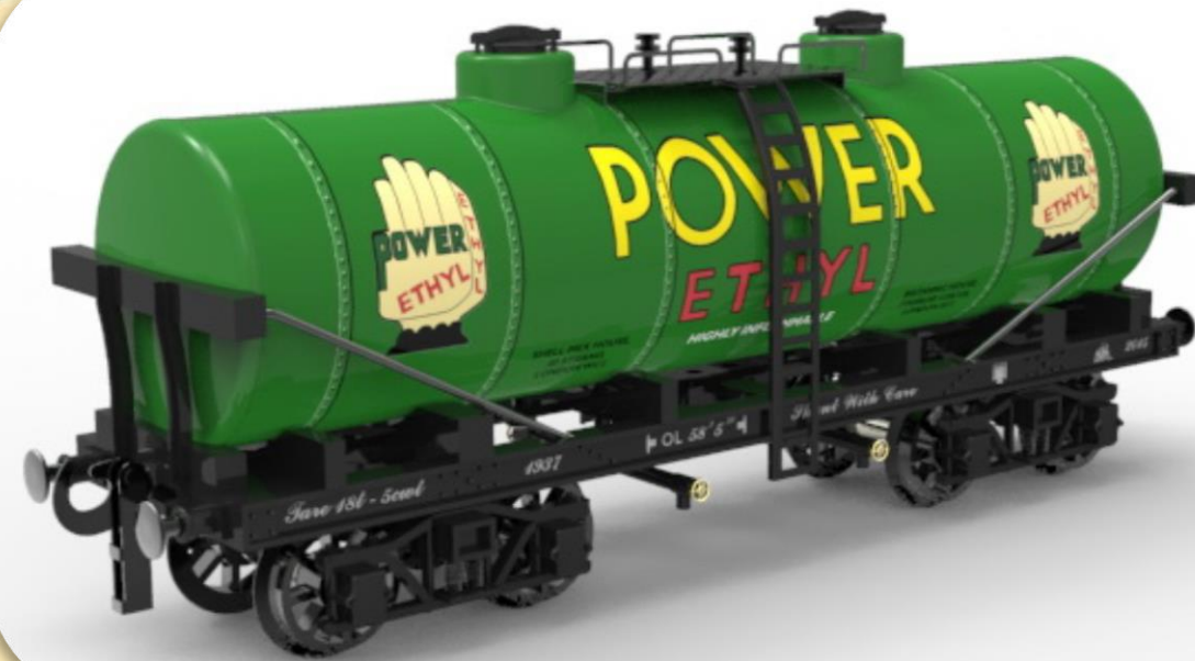
5. Power Ethyl