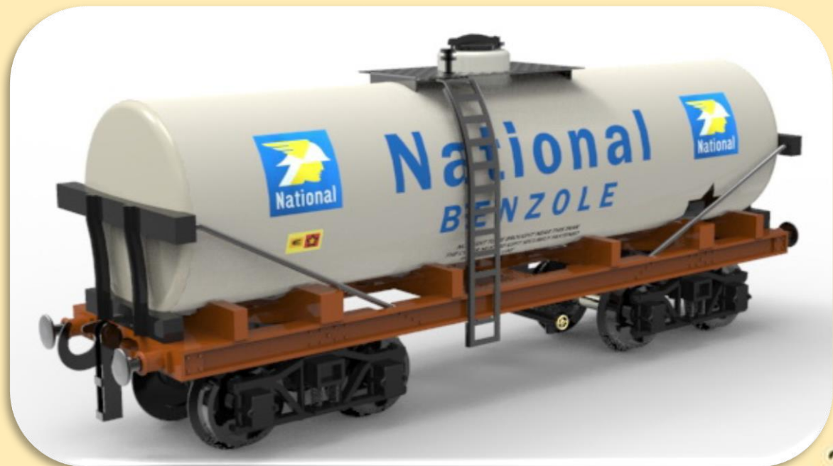
14. National Benzole