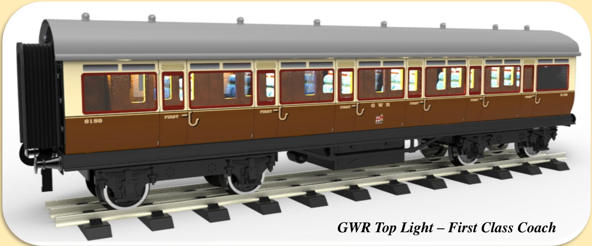
GWR Top Light – First Class Coach

Details of our program can be viewed @ : http://www.darstaed.com/products_b004.html