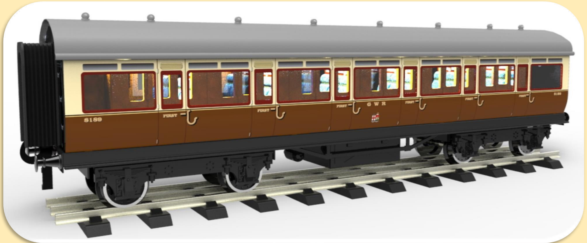
GWR Top Light – First Class Coach

Details of our program can be viewed @ : http://www.darstaed.com/products_b004.html