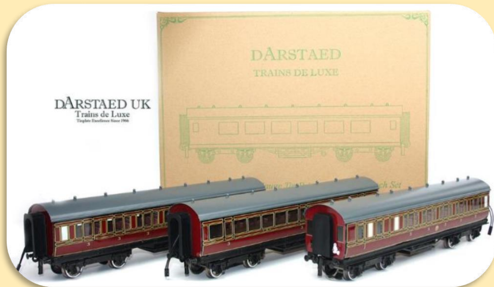
LMS Period I – Set A

Although in the coming week we will have shipped out all the 50 Sets A of each of the first four liveries we have enough parts left to make any quantity required for our customers in the USA assuming that if they wish to order Sets A, B and C together to save on the shipping costs we are able to supply at a later date.