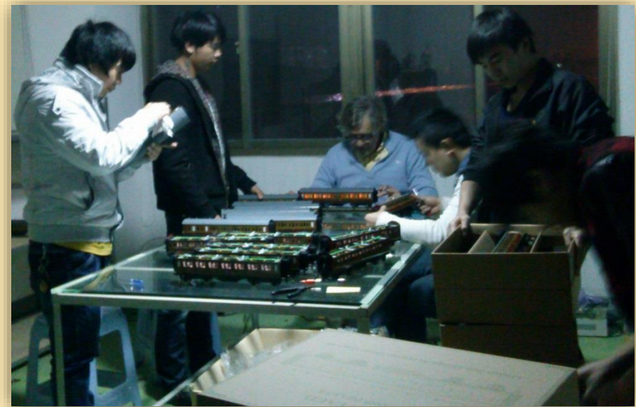
QC and Packing of the first lot of CC Coaches