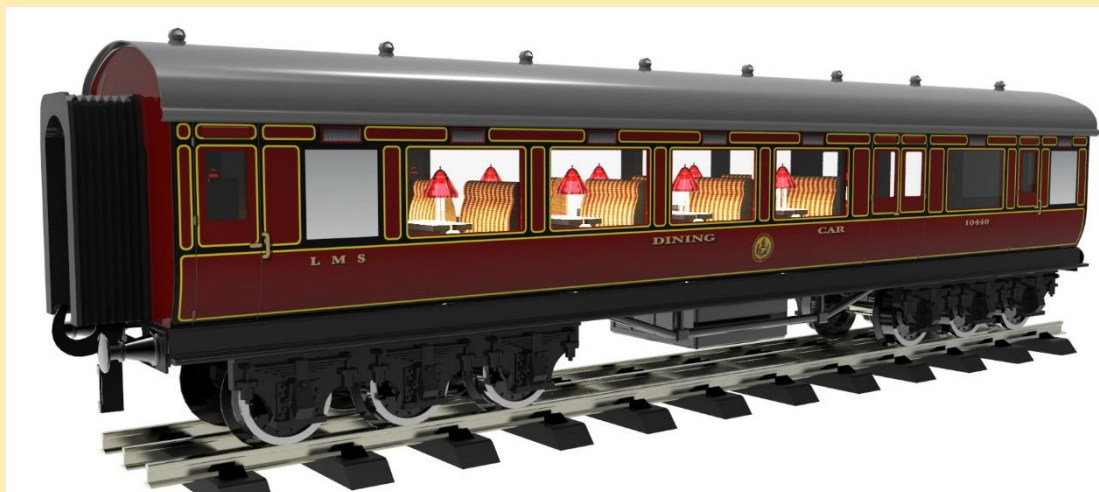
Dining Car LMS Period II

Sets B featuring the 12 wheel diners will follow in March and sets C containing the 12 wheel sleepers in April. After that we continue with GWR for all those Castles that are not running in suitable company. Regarding the diners we have decided two weeks ago that it would be nice to have white table cloth on the tables so that tool is being made now. We hope to have pictures to show you on our news site https://www.facebook.com/Darstaed just before the factory closes for Chinese New Year.